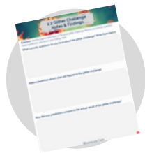
Notes & Findings Page