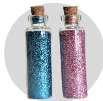
2 colors of glitter