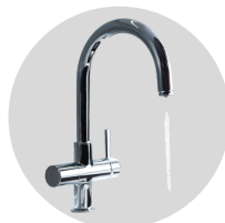
water from sink